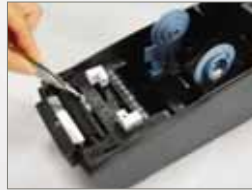
Reflective sensor (Black Mark Sensor)