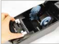
Transmissive sensor (Gap, Media sensor)

Well-constructed sensors are movable from side to side which means it supports various paper types and particular marked media rolls. Restick™ paper printing available with SLP-D220.